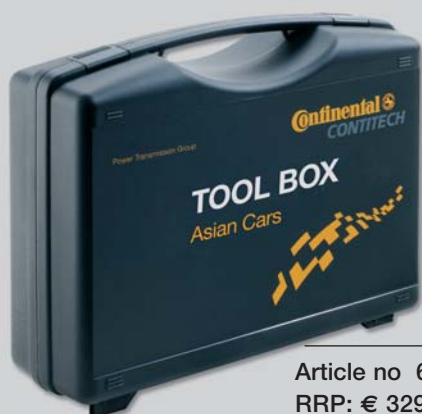
Article no 65 76 476 000 RRP: € 329.00 + VAT

Please give us a call if you have any questions: Tech. hotline +49 511 938-5178